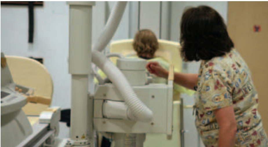
The digital vertical stand increases the range of applications